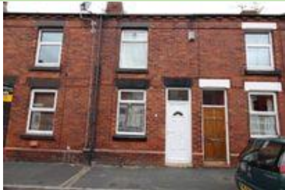
93 Edgeworth Street, Sutton, St Helens.

100 years ago houses were overcrowded, brothers and sister would have to share bedrooms. A lot of the fathers who lived in Sutton were coal miners. The school leaving age was officially 12, but many pupils left from ten onwards. Most people were very poor and did not have money to buy toys.